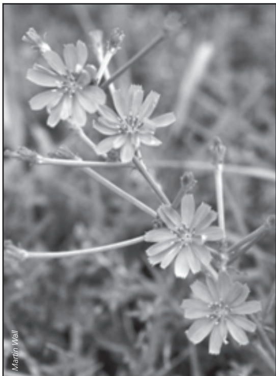
Cichorium intybus (chicory)

same time, the taste ratios in the modern American diet are far out of balance and deserve some challenge, meaning more bitter tasting foods in the diet, in order to bring about balance.