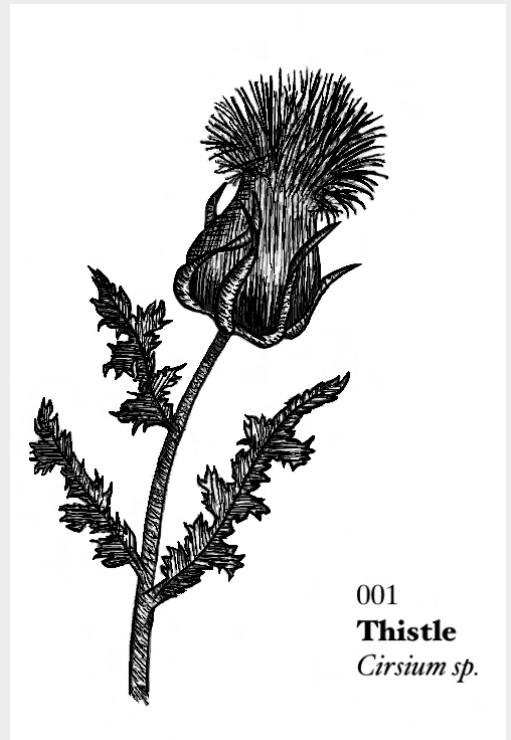
001 Thistle Cirsium sp.

Artist Statement: I've always loved drawing. Ever since I was little. But at an early age, my parents told me that being an artist was never going to get me far and that I needed to find an actual career path. So I did and it led me to the second love of my life - plants. While plants are all shades of color, black and white always looked the prettiest to me. And the plants that look the most obscure and otherworldly, the better.